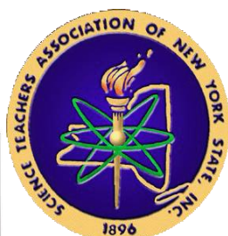
Science Teachers of New York State